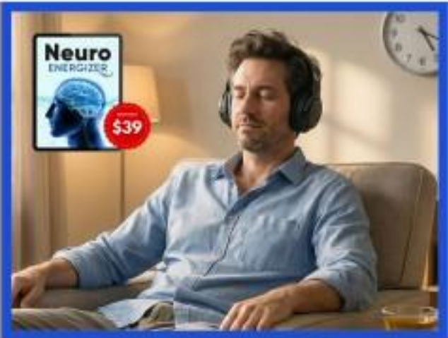
With Neuro ENERGIZER