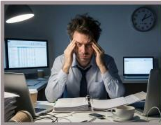
Without Neuro ENERGIZER